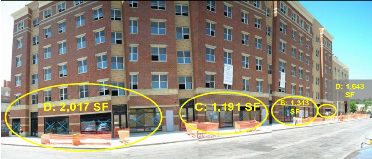
Standard divisions in picture are approximate. Picture taken August 2008.