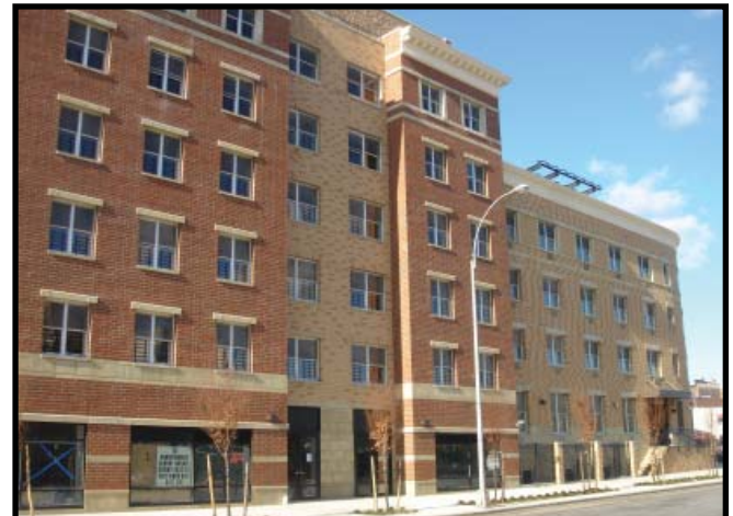
Intervale Green, WHEDCo's newest green, affordable housing development.