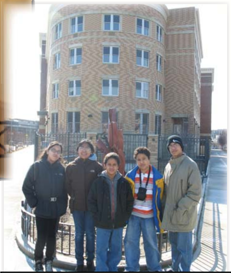
WHEDCo youth who attended the 2005 ground breaking return to tour Intervale Green.