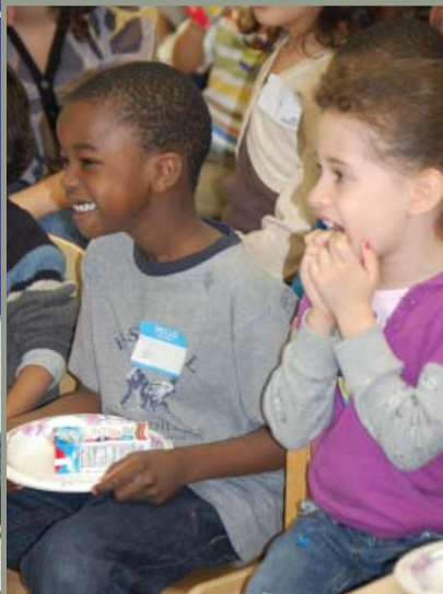
WHEDCo Head Start students giggle in anticipation during a winter magic show and celebration. More than 20 volunteers from Central Synagogue teamed up with 30 Head Start families for a day of food, fun and laughs! (left) (below) Head Start students enjoy a delicious meal with their friends during International Day.