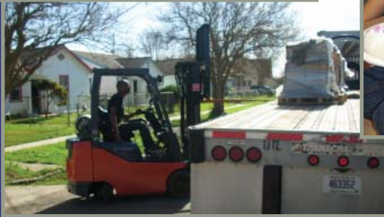
Excess high-end tile, donated by Artistic Tile and used throughout Intervale Green, is unloaded in New Orleans to help families affected by Hurricane Katrina rebuild their homes. Read more about the gift that keeps giving in the New York Times in the press section of www.whedco.org .