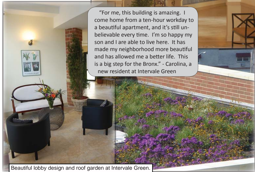
Beautiful lobby design and roof garden at Intervale Green.

Learn how you can help, donate online at www.whedco.org