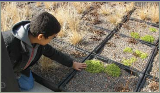
Youth from WHEDCo's after school program explore the green roof at Intervale Green.

Women's Housing and Economic Development Corporation 50 East 168th Street Bronx, New York 10452 www.whedco.org Phone: 718-839-1100 Fax: 718-839-1170 Email: info@whedco.org